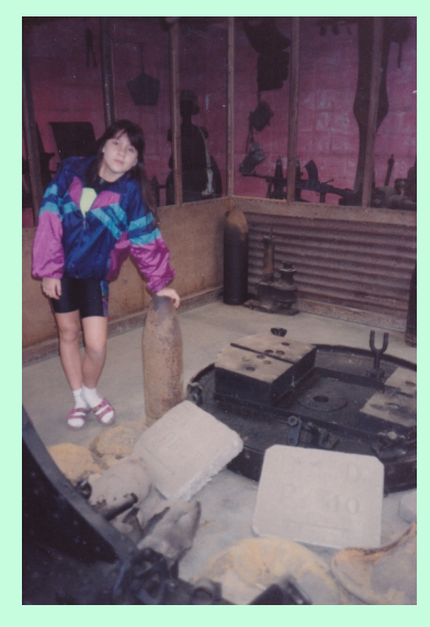
▲ Sanctuary Wood museum

In the picture (below right), note the low height of the trench; this was partly because people in those days were not as tall as today.