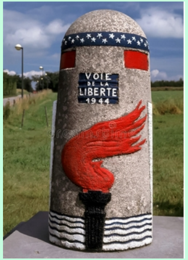
▲ Bastogne war museum and US war memorial